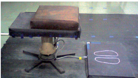
Figure 2. Schematic diagram of subject sitting on experimental setup.

amplifier control units (Kistler, Switzerland) and a data logger (BTS Bioengineering, Italy). The initial body weight was recorded when the volunteers were standing barefoot on the platform with their eyes open, when sensory inputs (visual, vestibular and somato-sensory) were unaltered for possible postural control. Standing or sitting on the multicomponent piezoelectric force platforms provided dynamic and quasi-static measurements of three forces along three orthogonal axes f_x , f_y and f_z , and three moments around the three axes m_x , m_y and m_z .