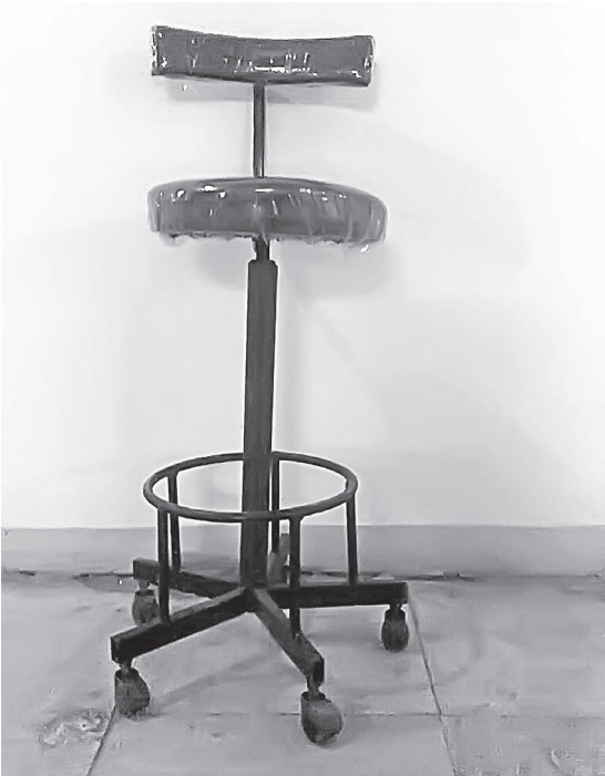
Figure 2. An adjustable stool for measuring body dimensions.

In the first part of the study, the participants answered questions on their age, experience, daily work time and work content, and the occur-