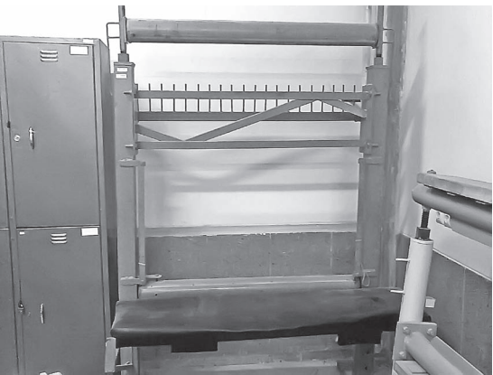
Figure 4. A rotative weaving loom built at the Carpet Department of the Islamic Art University of Tabriz, Iran.

Notes. A, B, C, D, E, F, G, H, I = see Figure 3.